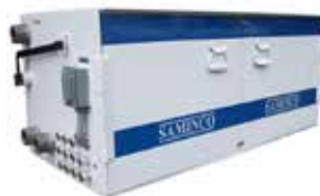
230V - 1000V