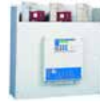
230V - 1000V Starter Modules