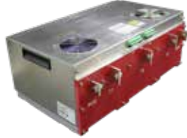
VF Series Tram