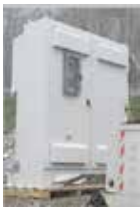
230V - 600V Outdoor VFD